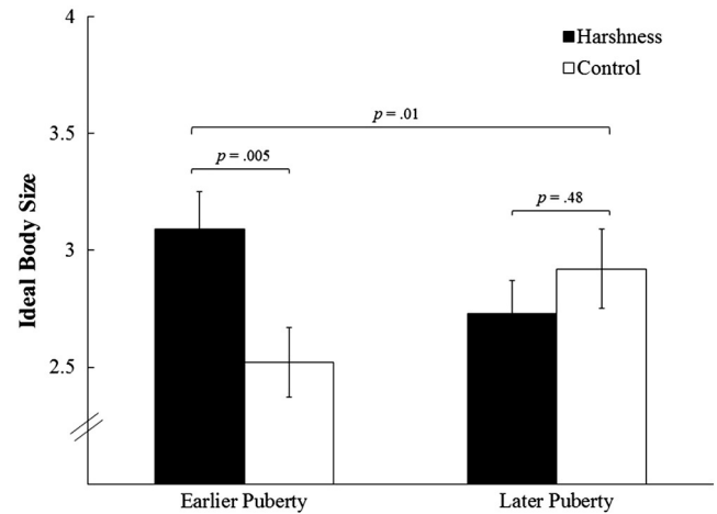
Fig. 2. The size of women's ideal body as a function of priming condition (harshness vs. control) and pubertal timing (Study 2). Plotted means represent one standard deviation above and below the mean of pubertal timing. Error bars reflect the standard error.

We probed this interaction by examining the effects of priming condition and pubertal timing on ideal body size separately for men and women. For women, the results revealed the predicted interaction between condition and pubertal timing on ideal body size, \beta = .39 ( SE = .12 ), t(71) = 2.58 , p = .01 , semi-partial r^2 = .08 . Simple slope tests revealed that for women in the harshness condition, earlier puberty predicted a heavier body ideal, \beta = -.30 ( SE = .08 ), t(71) = -1.93 , p = .06 , semi-partial r^2 = .05 . No such relationship was present for women in the control condition ( p = .09 ). Furthermore, examining the effects of harshness (vs. control) cues among women with earlier (1 SD below the mean) and later (1 SD above the